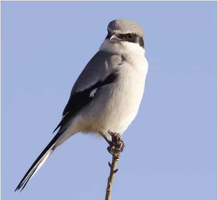
LOGGERHEAD SHRIKE