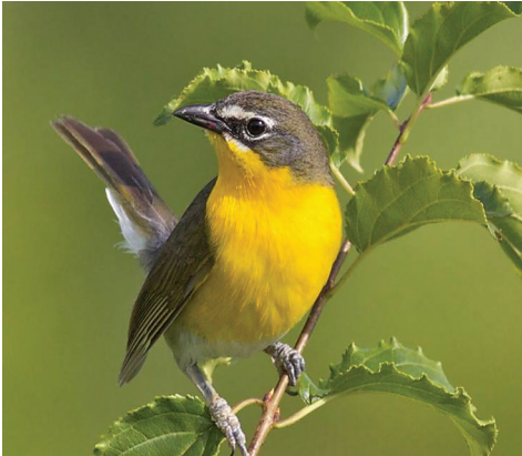
YELLOW-BREASTED CHAT